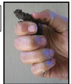
Figure 6. Squeeze soil, pushing