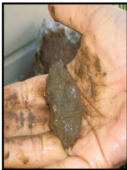
Figure 5. Prepare soil for the ribbon test by moistening and kneading.