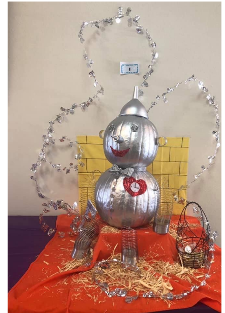
Congratulations to the Auditor's office for winning the Best Decorated Department Pumpkin! Photos of Department pumpkins can be found on the County's Facebook page.

Congratulations to the County employees recognized in the months of August, September and October!