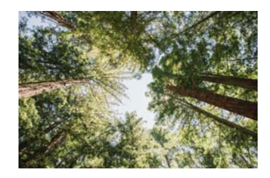
For more information, visit the Cultural Services Agency's website at:

Come visit the Vintage Toy Exhibit, and remember admission is free with your Mendocino County Library Card. The Museum will be hosting Vintage Toy Making Workshops on Saturday, January 19, and February 16, 2019, from 1:00 p.m. – 3:00 p.m.