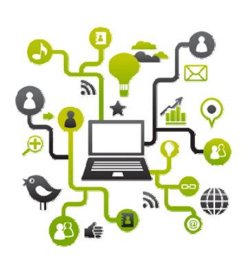
Check out Mendocino County's Career Page, powered by NEOGOV. www.governmentjobs.com/careers/mendocinoca

<u>www.mendocinocounty.org/government/</u> executive-office/parks