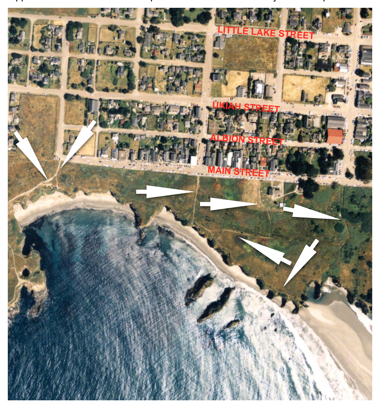
Appendix 5. Public Access Component Detailed Access Way Aerial Map 5.2

Appendix 5.2. Vertical Aerial Photograph of coastal access in the Town of Mendocino, California: Parking along westerly Main Street, blufftop and beach access paths in Mendocino Headlands State Beach, Ford House Visitor Center, westerly Big River beach at lower right Lansing Street extends north along the right side of the photograph; Kasten and Heeser Streets parallel Lansing Street to the west. North of east-west Main Street are narrow Albion Street, Ukiah Street, and Little Lake Street near the top of the photograph..