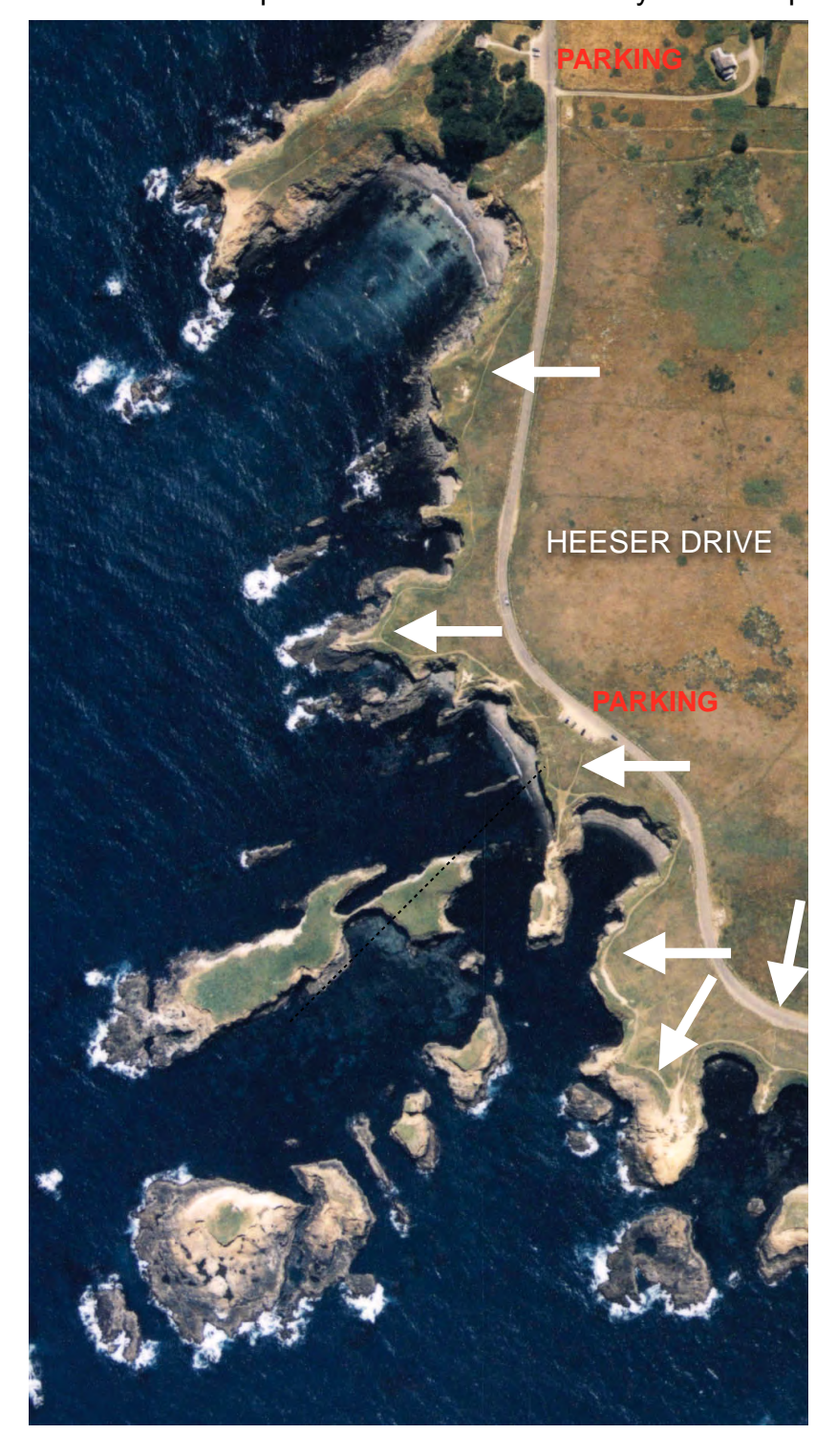
Appendix 5. Public Access Component Detailed Access Way Aerial Map 5.5