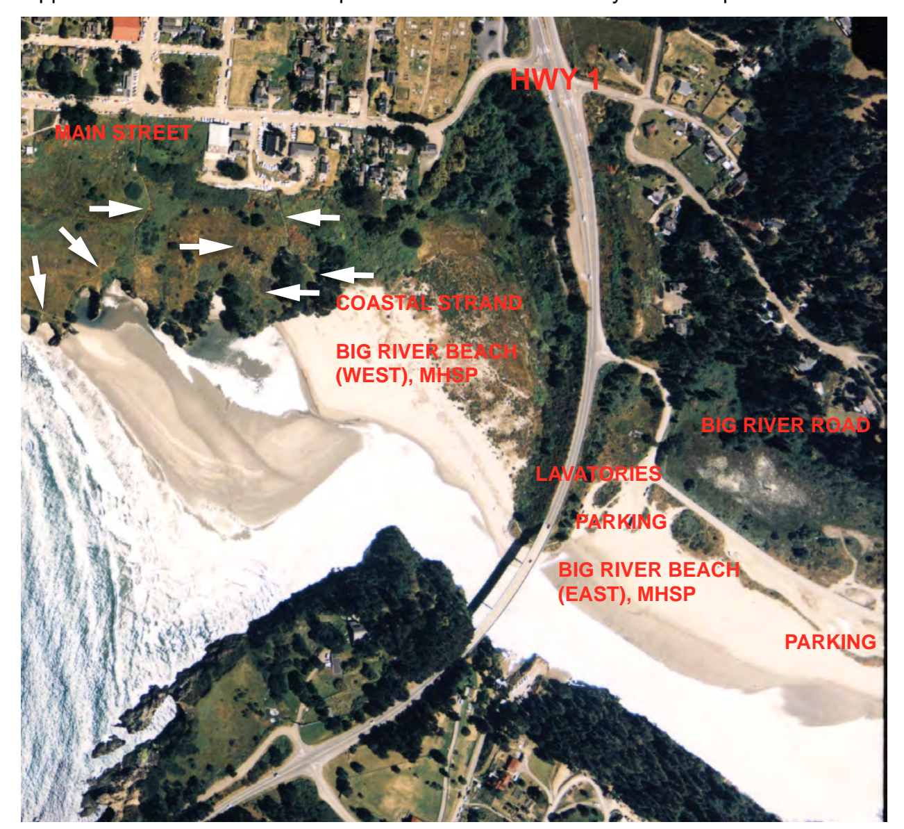
Appendix 5. Public Access Component Detailed Access Way Aerial Map 5.1

Appendix 5.1. Vertical Aerial Photograph of coastal access in the Town of Mendocino, California: Mendocino Estuary Beaches west and east of the California Highway 1 Big River Bridge (constructed in 1961). Main Street extends west from Highway 1 in the upper left; Big River Road provides access from Highway 1 to the Big River Flat beach (site of the lumber mill between 1854 and the 1930's) in the lower right, to trails in the protected Big River watershed (part of expanded Mendocino Headlands State Park), and contiguous adjacent State Parks and Jackson Demonstration State Forest. Lateral public access is available along Big River Beach beneath the Highway 1 bridge; the updated Mendocino Town Plan (2015) proposes a continuous lateral upland trail in Mendocino Headlands State Park to connect Big River Beach with the State Park to the west and safe pedestrian and bikeways on Big River Bridge for enhanced access along the California Coastal Trail.