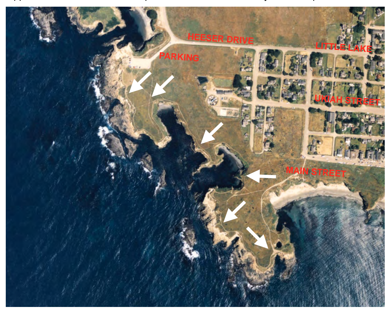
Appendix 5. Public Access Component Detailed Access Way Aerial Map 5.3

Appendix 5.3. Vertical Aerial Photograph of coastal access in the Town of Mendocino, California: Blufftop paths, parking, and beaches in southwesterly Mendocino Headlands State Park at west Heeser Drive (upper left-center) and west Main Street at Heeser Street (lower center). State Parks owns the rectangular parcel west of the intersection of Main and Heeser Streets, where recommended recreational upland support facilities should be located to serve the southwesterly area of the State Park. Additional public parking is recommended along westerly Main Street, lower Heeser Street, and easterly Heeser Drive, west of its intersection with Heeser Street. The peninsula at lower middle was the site of the 1850's-1930's Mendocino railroad, lumber yard, and wharves/chutes maritime shipping facility. California Department of Boating and Waterways Image CDBW-BBK-C 166-13 6-13-93. Used with permission. Copyright (C) 2002-2015 Kenneth & Gabrielle Adelman, California Coastal Records Project, www.Californiacoastline.org