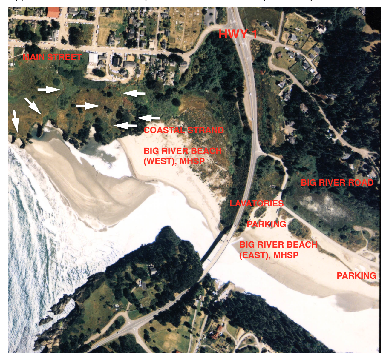
Appendix 5. Public Access Component Detailed Access Way Aerial Map 5.1

Appendix 5.1. Vertical Aerial Photograph of coastal access in the Town of Mendocino, California: Mendocino Estuary Beaches west and east of the California Highway 1 Big River Bridge (constructed in 1961). Main Street extends west from Highway 1 in the upper left; Big River Road provides access from Highway 1 to the Big River Flat beach (site of the lumber mill between 1854 and the 1930's) in the lower right, to trails in the protected Big River watershed (part of expanded Mendocino Headlands State Park), and contiguous adjacent State Parks and Jackson Demonstration State Forest. Lateral public access is available along Big River Beach beneath the Highway 1 bridge; the updated Mendocino Town Plan (2015) proposes a continuous lateral upland trail in Mendocino Headlands State Park to connect Big River Beach with the State Park to the west and safe pedestrian and bikeways on Big River Bridge for enhanced access along the California Coastal Trail.