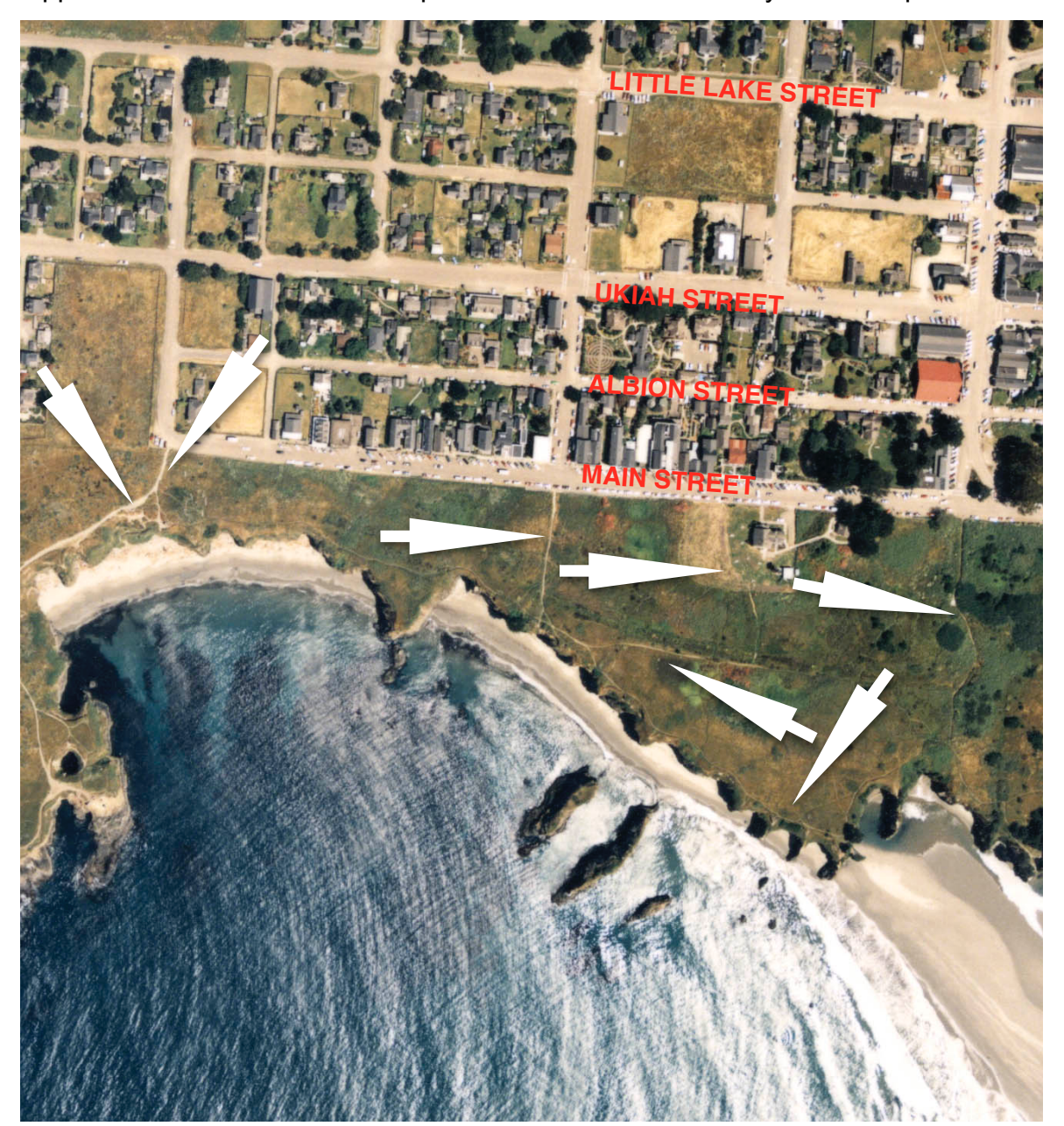
Appendix 5. Public Access Component Detailed Access Way Aerial Map 5.2

Appendix 5.2. Vertical Aerial Photograph of coastal access in the Town of Mendocino, California: Parking along westerly Main Street, blufftop and beach access paths in Mendocino Headlands State Beach, Ford House Visitor Center, westerly Big River beach at lower right Lansing Street extends north along the right side of the photograph; Kasten and Heeser Streets parallel Lansing Street to the west. North of east-west Main Street are narrow Albion Street, Ukiah Street, and Little Lake Street near the top of the photograph..