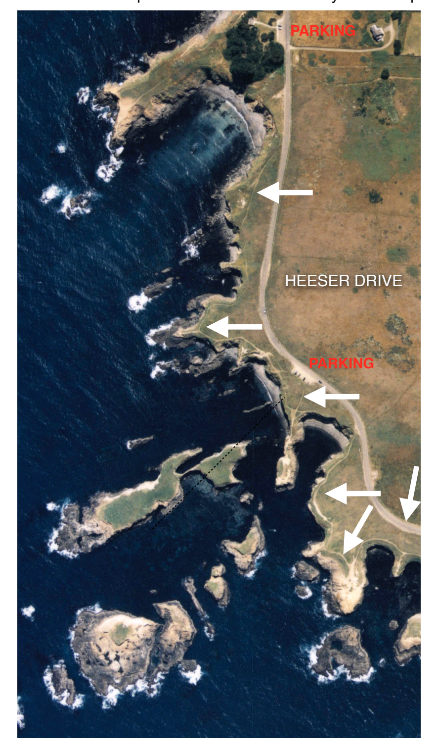
Appendix 5. Public Access Component Detailed Access Way Aerial Map 5.5