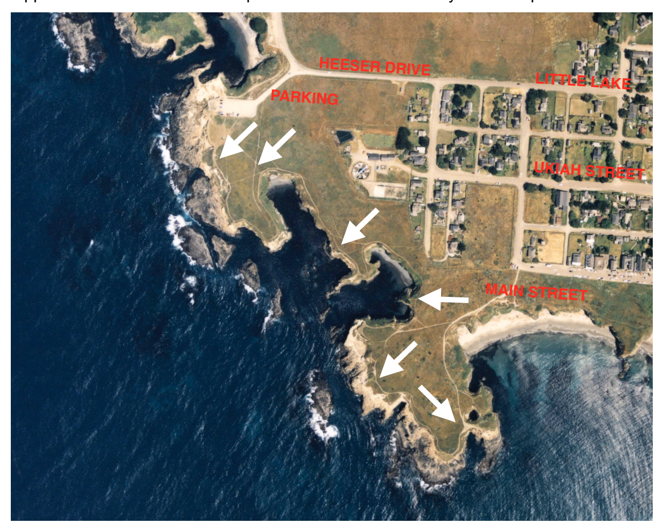
Appendix 5. Public Access Component Detailed Access Way Aerial Map 5.3

Appendix 5.3. Vertical Aerial Photograph of coastal access in the Town of Mendocino, California: Blufftop paths, parking, and beaches in southwesterly Mendocino Headlands State Park at west Heeser Drive (upper left-center) and west Main Street at Heeser Street (lower center). State Parks owns the rectangular parcel west of the intersection of Main and Heeser Streets, where recommended recreational upland support facilities should be located to serve the southwesterly area of the State Park. Additional public parking is recommended along westerly Main Street, lower Heeser Street, and easterly Heeser Drive, west of its intersection with Heeser Street. The peninsula at lower middle was the site of the 1850's-1930's Mendocino railroad, lumber yard, and wharves/chutes maritime shipping facility. California Department of Boating and Waterways Image CDBW-BBK-C 166-13 6-13-93. Used with permission. Copyright (C) 2002-2015 Kenneth & Gabrielle Adelman, California Coastal Records Project, www.Californiacoastline.org